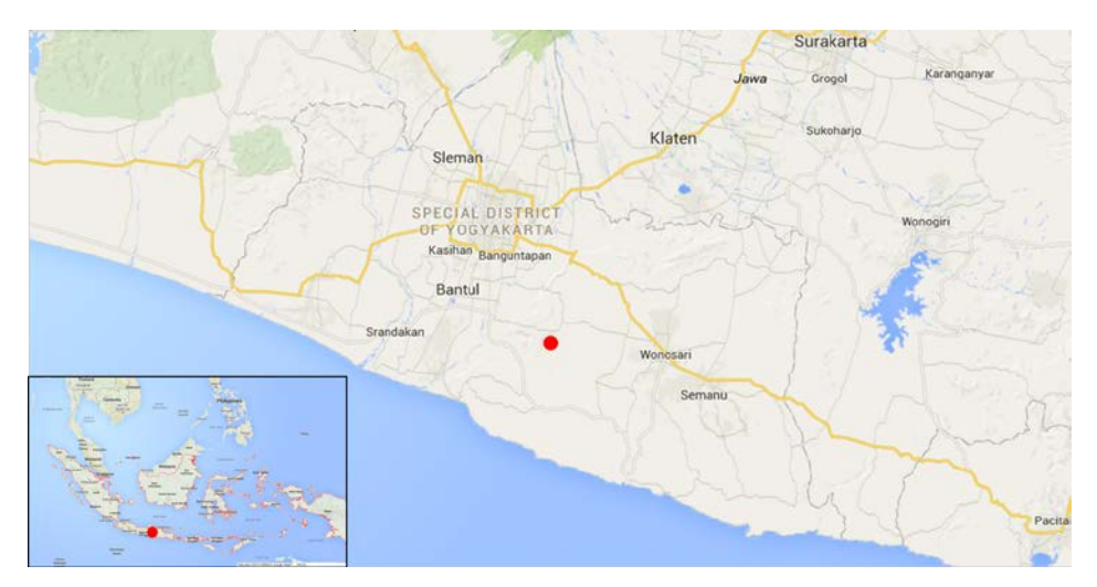
Figure 1 Approximate location of earthquake indicated. Key affected areas included the Klaten, Bantul and Sleman districts. Map from Google (Map data: GBRMPA, Google, MapIT).

On 26 May 2006 (Day 1), a magnitude 6.3 earthquake occurred in Galur subregency, Yogyakarta, at a depth of 10 km [5] (Figure 1). Ground shaking was felt on much of Java island and was said to be more intense than deeper earthquakes of the same magnitude. The shaking caused extensive damage to infrastructure, compounded by high population densities and poor construction [6]. Key affected areas included the Klaten, Bantul and Sleman districts, located in parts of the Central Java and Yogyakarta provinces. According to OCHA's [7] situation reports, 608,008 houses were destroyed or damaged, which was approximately 30% of the housing stock in the affected areas.